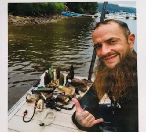
Across from the Springs Store