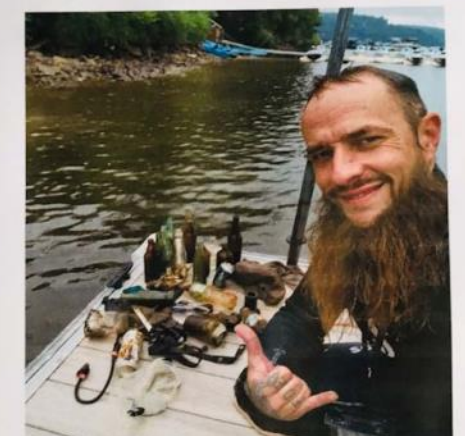
Across from the Springs Store