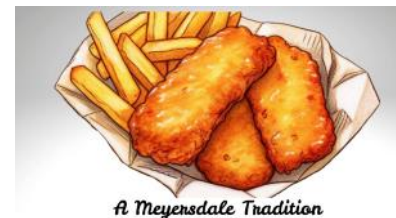
A Meyersdale Tradition

Meyersdale Elks Lodge 327 Dale St, Meyersdale